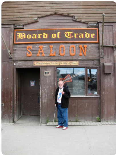
Nome AK BOD 2011