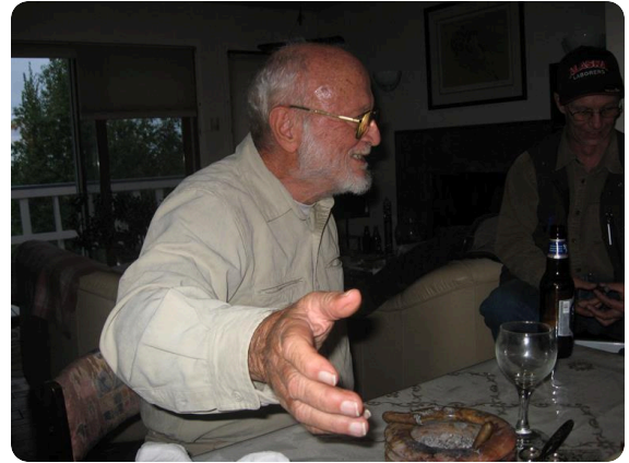
Eagle River AK June 2008