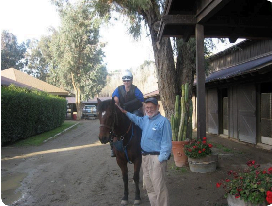
Shy Boy Monty Roberts Ranch Solvang CA 2007