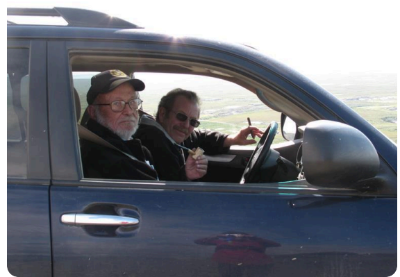
Anvil Mountain AK July 2011