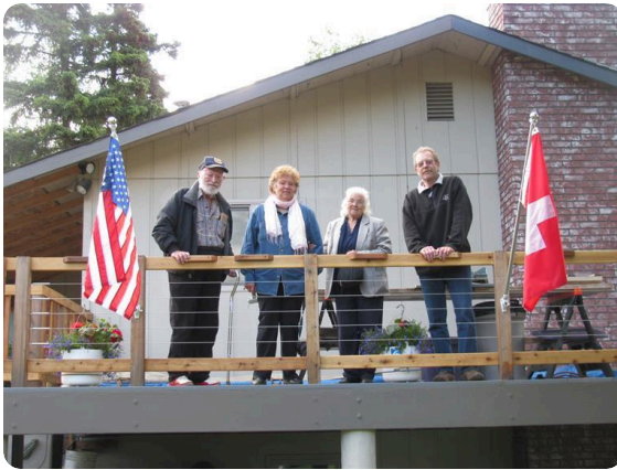
Swiss Day August 1 Eagle River with CH friends 2011