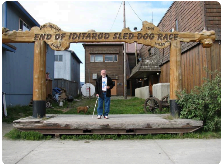
Nome AK 2011