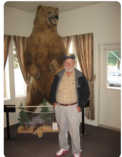
Dawson City Yukon 2006