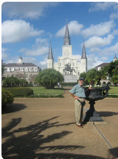
New Orleans Jackson Square 2007