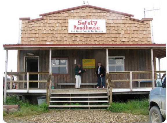
Safety AK 2011